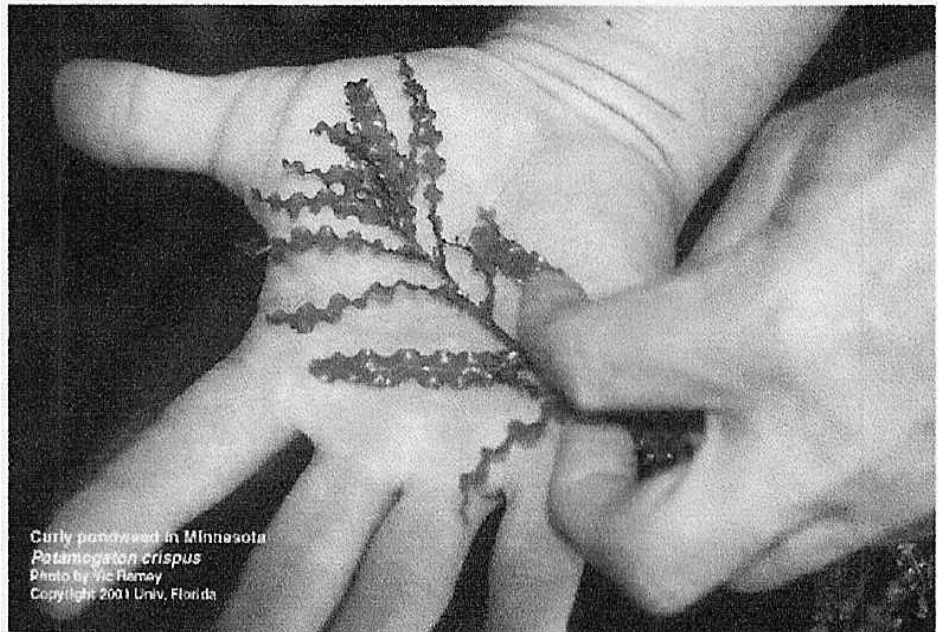
Curly pondweed in Minnesota Potamogeton crispus

Starting last year and to continue this year, with years into the future, control of the aquatic invasive species, curly leafed pondweed, will be carried out. Curly leafed pondweed is an increasing problem for Deer Lake. It is an exotic plant that generally will continue to spread throughout a lake, often with native aquatic plants unable to compete. This can make swimming, boating, fishing and other recreational uses of a body of water difficult if not impossible. This exotic plant usually mats at the surface in early spring and even boats can have trouble navigating through the area.