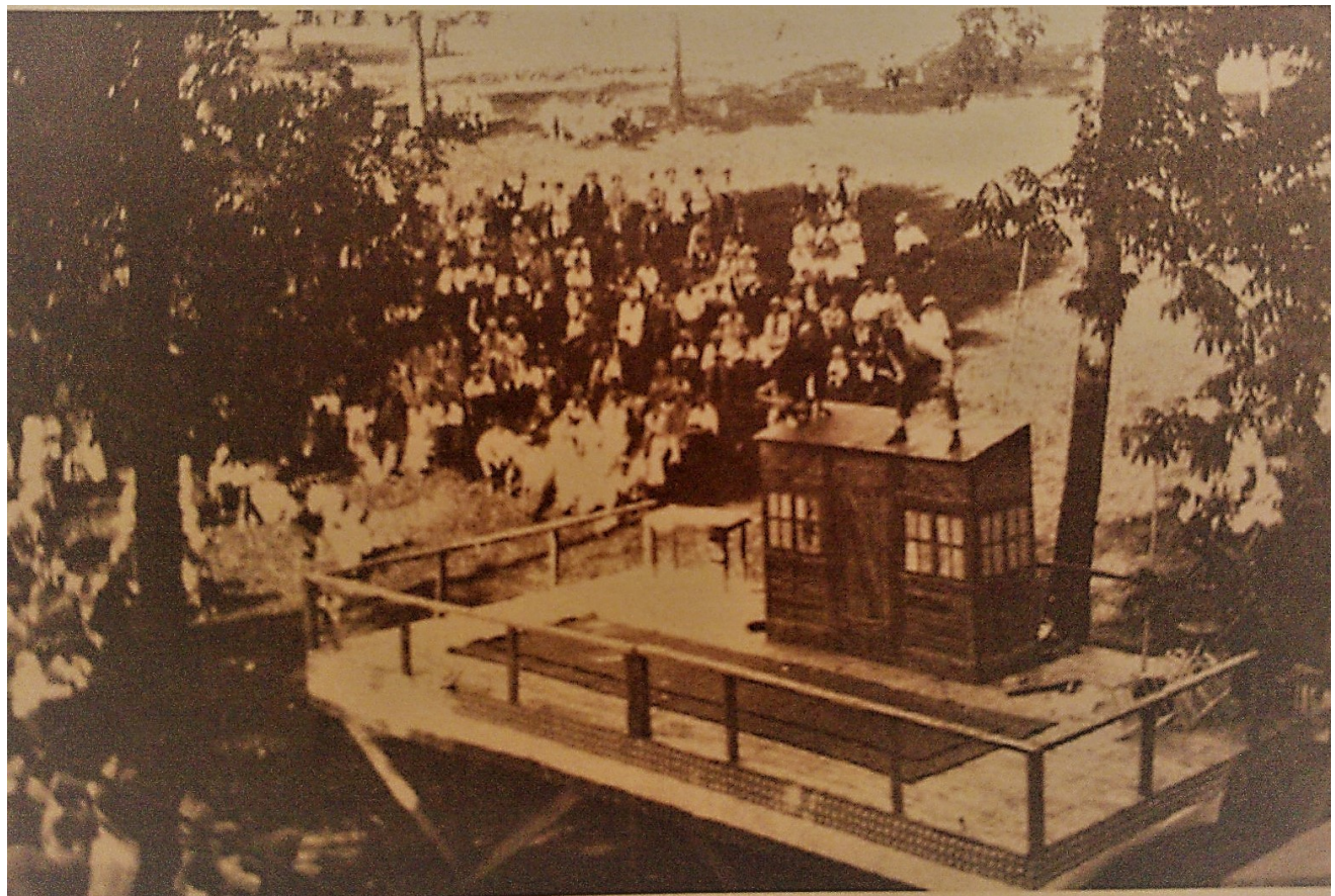
At Tipperary around 1928. A crowd gathers to watch the entertainment.