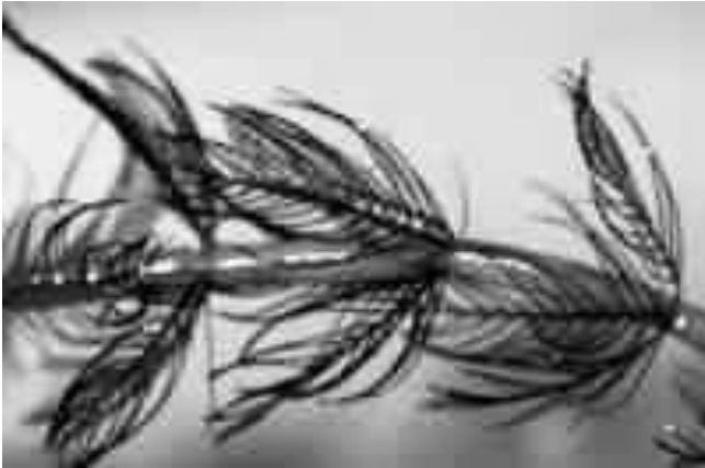
Invasive Eurasian Milfoil (12 to 21 pairs of leaflets)

Below is a picture of Eurasian Milfoil – there is also a Northern Milfoil which is native to Wisconsin. The Eurasian Milfoil has 12 to 21 pairs of leaflets as shown here, while the Northern Milfoil typically has 5 to 9 pairs.