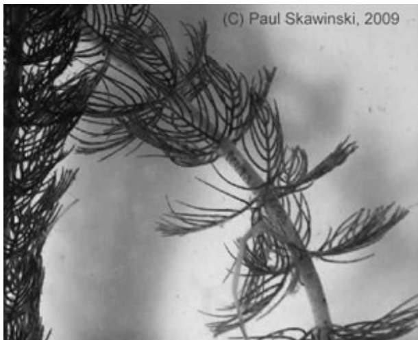
Native Northern Milfoil (5 to 9 pairs of leaflets)

Eurasian Milfoil has difficulty becoming established in lakes with well-established populations of native plants. This is why it is so important to allow the native plants to grow in our lake.