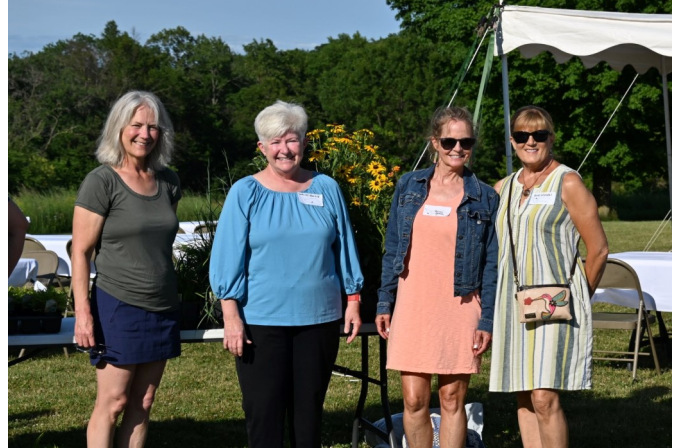
Flagstad Farm 2022